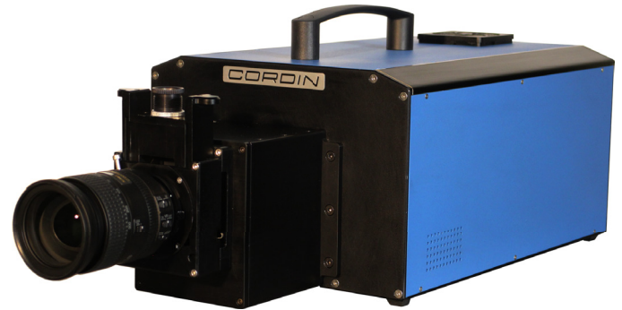
(Model 164 shown with optional objective lens)

Streak cameras record a thin, wide line of light signals at the fastest possible speeds. They capture subtle variations in intensity from a line image, a spread spectrum, or linear array of discrete signals with resolution down into the picoseconds.