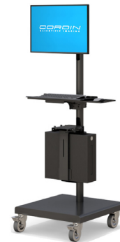
Separate PC Control Station (included)

Also compatible with the Model 222 series cameras, the Model 1500 allows for mounting of the PC control station on the cart itself in these cases where a Gas Control Box is not required.