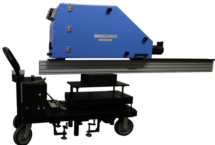
Model 1500 Stand shown with 131-HD Streak Camera and Rail-mount option

An optional integrated rail mount system enables secure and precise placement of the photo subject.