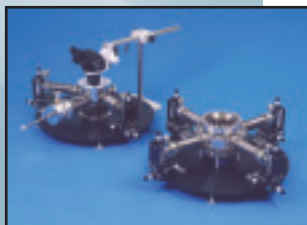
Micro-manipulated Probe Stations

Several different probes are available for use with signals ranging from DC to microwave, and a combination of both low and high frequency probes can be supplied with a single system. Designs with four probes are the most commonly supplied configuration, though two, six or more probes can be included. The modular design offers the advantage of using the same cryostat in a variety of experiments, including LCC, fixed probe, probe cards, DLTS, optical and magnetic field dependent studies.