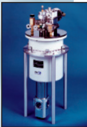
Top Loading 4 K Closed Cycle System