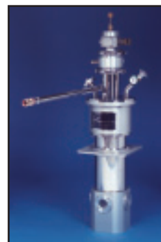
Sample in Vapor Continuous Flow Cryostat