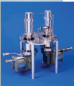
Mechanically Cooled Cryogenic Cold Trap