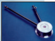
Low Vibration Microscopy Cryostat