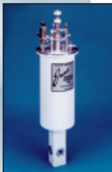
High Efficiency Variable Temperature Reservoir Cryostat