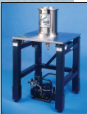
Vibration-isolated Continuous Flow Probe Cryostat