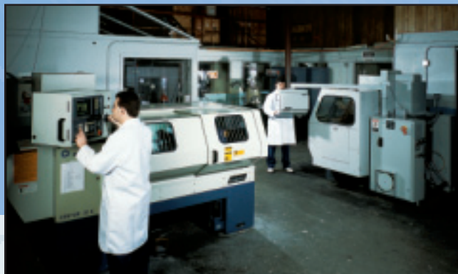
Janis Research Manufacturing Facility

Incorporated in 1961, Janis Research Company, Inc. is recognized as one of the foremost suppliers of cryogenic equipment in the world. Through the years, Janis Research has been continually dedicated to the design, fabrication and delivery of the best systems and components in the industry. Using state-of-the-art CAD/CAM systems, Janis Research has developed the broadest range of cryogenic products in the business. With an installed base of over 8,000 systems and a staff of highly skilled scientists, Janis Research has the experience and the expertise to supply the system best suited to meet your cryogenic requirements.