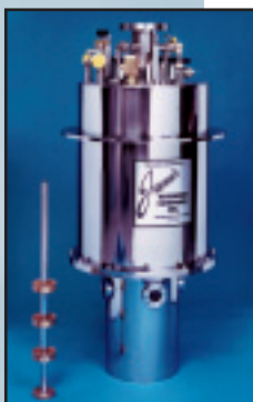
Cryostat for Scanning Probe/Force Microscopy