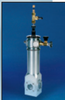
Liquid Nitrogen Pourfill Reservoir Cryostat