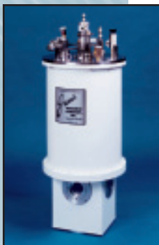
Optical Split Pair Magnet