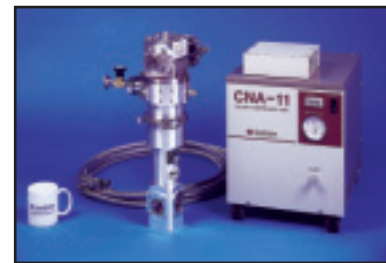
Compact Optical 4 K Closed Cycle System

Janis Research 4 K CCR designs can be used as a direct replacement for liquid helium cooled systems. Depending upon the cost of liquid helium and hours of operation, typical annual cost savings can range from $5,000 to $50,000 or more. Janis Research offers a broad range of 4 K CCR systems, with cooling powers ranging from 0.1 to 1.5 watts @ 4.2 K. In addition to complete cold finger and exchange gas cooled cryostats, bare 4 K cryocoolers can be provided for use in cryostat shield cooling, helium recondensing, astronomical applications and more.