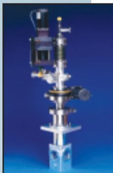
FTIR Cryostat with Motorized Sample Manipulation

The SuperTran-VP series (STVP) provides sample in vapor cooling from 1.5 K to 300 K and higher, and includes a top loading sample probe. Rapid sample changes are possible, and samples with poor thermal characteristics (i.e., liquids and powders) or irregular shapes can easily be cooled. Application specific models include NMR, ESR and FTIR.