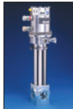
Original APD Cryogenics Cryocoolers

Janis Research CCR designs begin with cryocoolers supplied by several of the world's leading manufacturers of cryogenic refrigerators. Unlike most other cryostat manufacturers, Janis Research is not restricted to a single cryocooler supplier, and can therefore suggest the most suitable cryocooler for any particular application. Janis Research has designed and built CCR systems for an extremely broad range of applications including VSM, Mössbauer, matrix isolation, Hall measurements, microwave device cooling, detector cooling, x-ray and neutron diffraction, and many more. Temperature ranges are available from 7 K to 800 K.