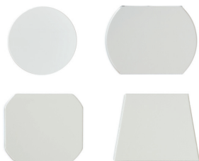
Various Cut Polarizer Shapes and Sizes