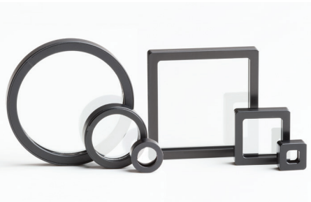
PBS Beamsplitters (mounting optional)

ProFlux® beamsplitter Nanowire® Technology is optimized to operate at 45°, providing durable polarizing beamsplitters. These beamsplitters can be used for a variety of both imaging and non-imaging applications for display products and scientific instruments. The ProFlux polarizing beamsplitter's wide angular aperture, excellent performance and exceptional reliability offer an excellent design choice.