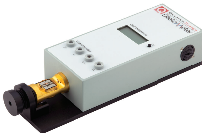
Dilatometer Capsule installed in the Balance Meter