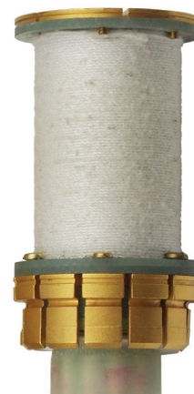
AC DR Coil Set