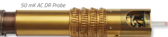
50 mK AC DR Probe