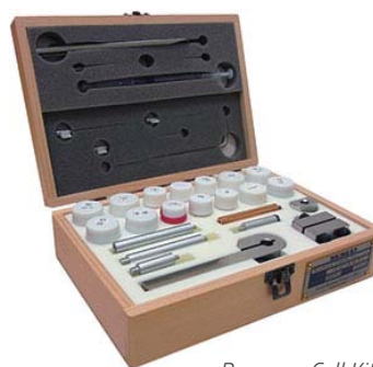
Pressure Cell Kit