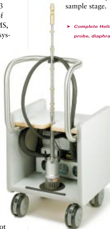
➤ Complete Helium-3 System with probe, diaphragm pump, and cart

The base of the ^3\text{He} -refrigerator probe plugs into the 12-pin connector, which provides electrical access to the measurement hardware at the bottom of the PPMS sample chamber. Thermal anchoring baffles along the probe assist in cooling and maintaining the probe at a base temperature of 1.9 K. Two gas-handling lines run through the length of the probe: the pump line and the return line. ^3\text{He} gas flows down the return line and condenses into the reservoir in the base of the probe. A turbo pump mounted at the top of the insert pumps on the liquid ^3\text{He} via the pump line, thus reducing the temperature. This reservoir is thermally linked to the sample stage that houses a thermometer, heater, and the interface for the sample-mounting platforms. Samples are mounted on measurement-specific sample mounts that plug into the sample stage.