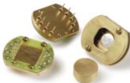
► Heat capacity and resistivity sample mounts for the Helium-3 System

Quantum Design's expertise is blending a reliable and robust system design with components that allow a high degree of experimental access and functionality. Our trademark has always been to provide users with systems that maximize performance and automation.