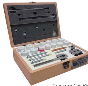
Pressure Cell Kit