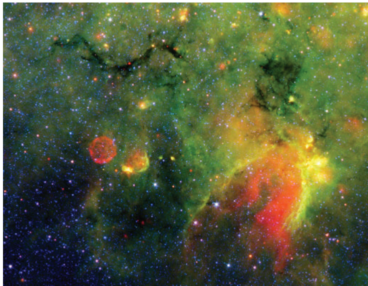
Image of Stellar Snake enabled by IR polarizer technology.

Tp- Transmitted “p” polarization, Ts- Transmitted “s” polarization, Tp/Ts