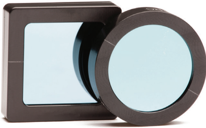
Mounted BIR ProFlux Polarizers